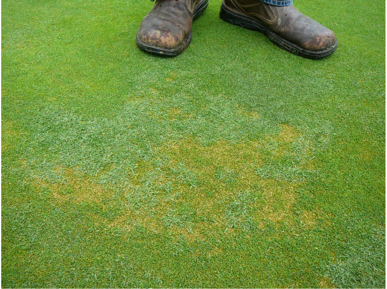
Basal rot anthracnose on an under-fertilized annual bluegrass putting green. Note the healthy, more tolerant creeping bentgrass growing among the infected, copper-colored Poa annua .