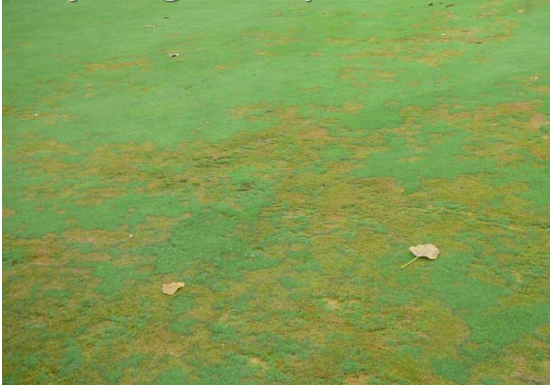
Pythium blight damage associated with overwatering and hot, humid conditions. Damage can occur very quickly, and note the disease can spread with water and mechanical traffic.